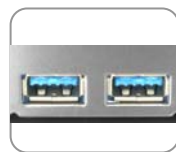
Two Individual USB Ports (PC)