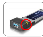
Access LED (NB)