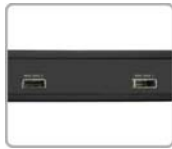
Two MiniSAS Host Interface