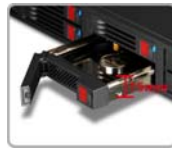
15 mm High HDD Tray

GT7280, a rackmount storage unit designed for SMB and Workstations. With physical capacity up to 8 of 2.5" HDD and embedded with 2 of miniSAS interface to fully consume the high speed performance. GT7280 comes with JBOD function and reserving upgrade ability by collocating a SAS RAID card as an applicative RAID storage unit, which is perfectly for engineering applications, graphical designs and video/audio editing purposes, GT7280 is an optimum alternative for storage expansion for the enterprises.