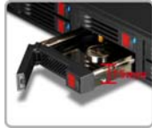
15 mm High HDD Tray

GT7280, a rackmount storage unit designed for SMB and Workstations. With physical capacity up to 8 of 2.5" HDD and embedded with 2 of miniSAS interface to fully consume the high speed performance. GT7280 comes with JBOD function and reserving upgrade ability by collocating a SAS RAID card as an applicative RAID storage unit, which is perfectly for engineering applications, graphical designs and video/audio editing purposes, GT7280 is an optimum alternative for storage expansion for the enterprises.