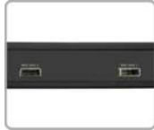
Two MiniSAS Host Interface