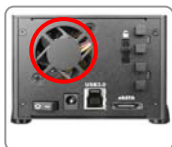
Low Rotation Fan