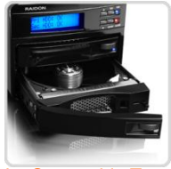
Hot Swappable Tray