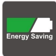
Energy Saving Design