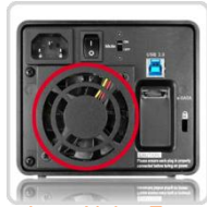
Less Noisy Fan