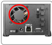
Low Rotation Fan