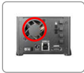
Low Rotation Fan